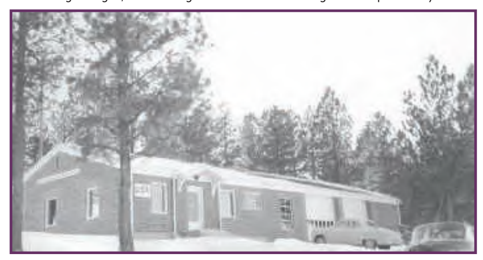
Black Hills Electric Cooperative moved to its current location two miles west of Custer in 1952. The above building is still used. The garage doors have been covered and that area is now the warehouse. The original office area on the left serves as an employee wellness room and storage.

The original headquarters building for Black Hills Electric Cooperative is in the left half of this photo. In 1962, a large addition gave the growing cooperative more office space. Since the buildings did not touch, a covered open garage was built between the two buildings. That area was later enclosed and became the manager's office and board room. With the exception of a few minor remodeling changes, the building remains close to its original floor plan today.