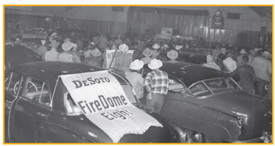
The 1952 annual meeting in Hot Springs looked like a drive-in meeting but it was local car dealers showing the new models. This year's meeting will really be at a drive-in.