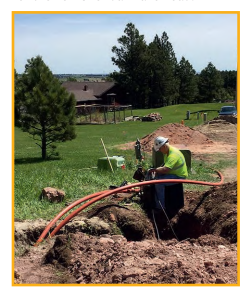
The Sheridan Lake Road construction project required BHEC to move some of the underground cables serving area subdivisions and businesses.