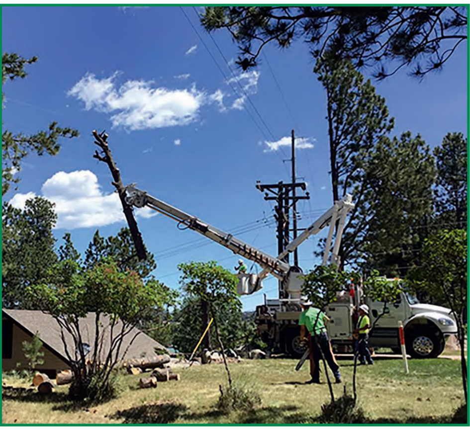
After using a bucket truck to limb this tree, BHEC's crews used a digger truck to carefully lift part of the trunk over the homeowner's roof. BHEC's rights-of-way program has helped reduce outages caused by trees that are in danger of making contact with the lines. Please contact the co-op if you see a danger tree.