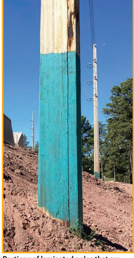
Portions of laminated poles that are currently above ground were treated to protect them after they are buried by fill for the new Sheridan Lake Road.