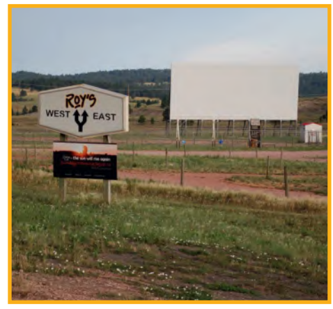
registering by September 15.

The pre-registration deadline is Tuesday, September 15. In addition to saving the co-op money, you might win a $300 cash prize or one of two $100 cash prizes for