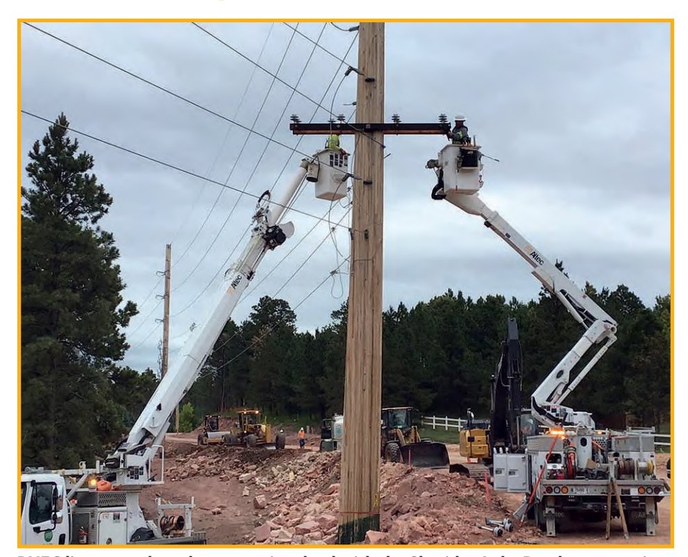
BHEC line crews have been very involved with the Sheridan Lake Road construction project. Above, crews add a cross arm to a laminated pole to increase the clearance of the line above the new road bed. The added road fill also required adding treatment to the pole base that will be covered with the additional dirt. Below, because of the raised road bed, several poles needed cross arms to maintain a safe distance from the road. The project also required BHEC crews to move underground wires that were in the right-of-way. The road rebuild will be from the Rapid City city limits to Highway 385 and require other line moves for the co-op.