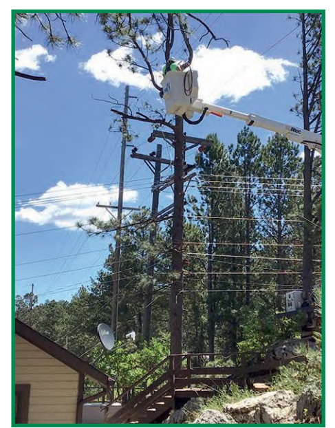
A maze of wires surrounded this tree that was recently removed by co-op crews. The job required a bucket truck and digger truck to safely remove it.

Contact the co-op at 673-4461 or 1-800-742-0085 to report danger trees.