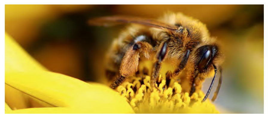
Honey bees pollinate roughly one-third of the world's agriculture crops.

honey bees. Since 2010, beekeepers in South Dakota, Minnesota and across the country have experienced historically high colony loss rates of nearly 30 percent a year impacting roughly 90 different agricultural crops ranging from almonds and apples on the West Coast to cotton and cranberries in the East.