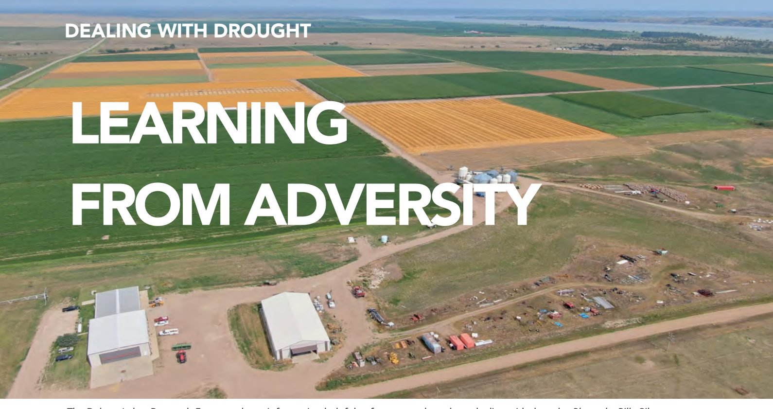
The Dakota Lakes Research Farm produces information helpful to farmers and ranchers dealing with drought.