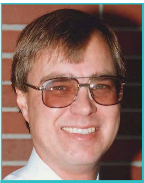
First day on the job at the co-op.

I want to thank the co-op members, directors and employees for helping make this part of my life so enjoyable and rewarding. My replacement will do things differently and probably better than I have, so I leave you knowing that my replacement and all the other great BHEC employees will be here to continue to provide you the best service possible and your directors will continue to watch your dollars closely. You own a great electric cooperative and can be proud of your directors and employees.