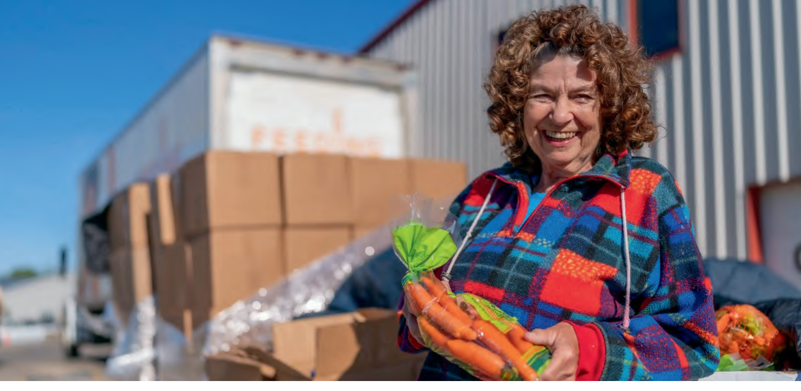
A volunteer distributes food to the needy at the Feeding South Dakota facility in Pierre.