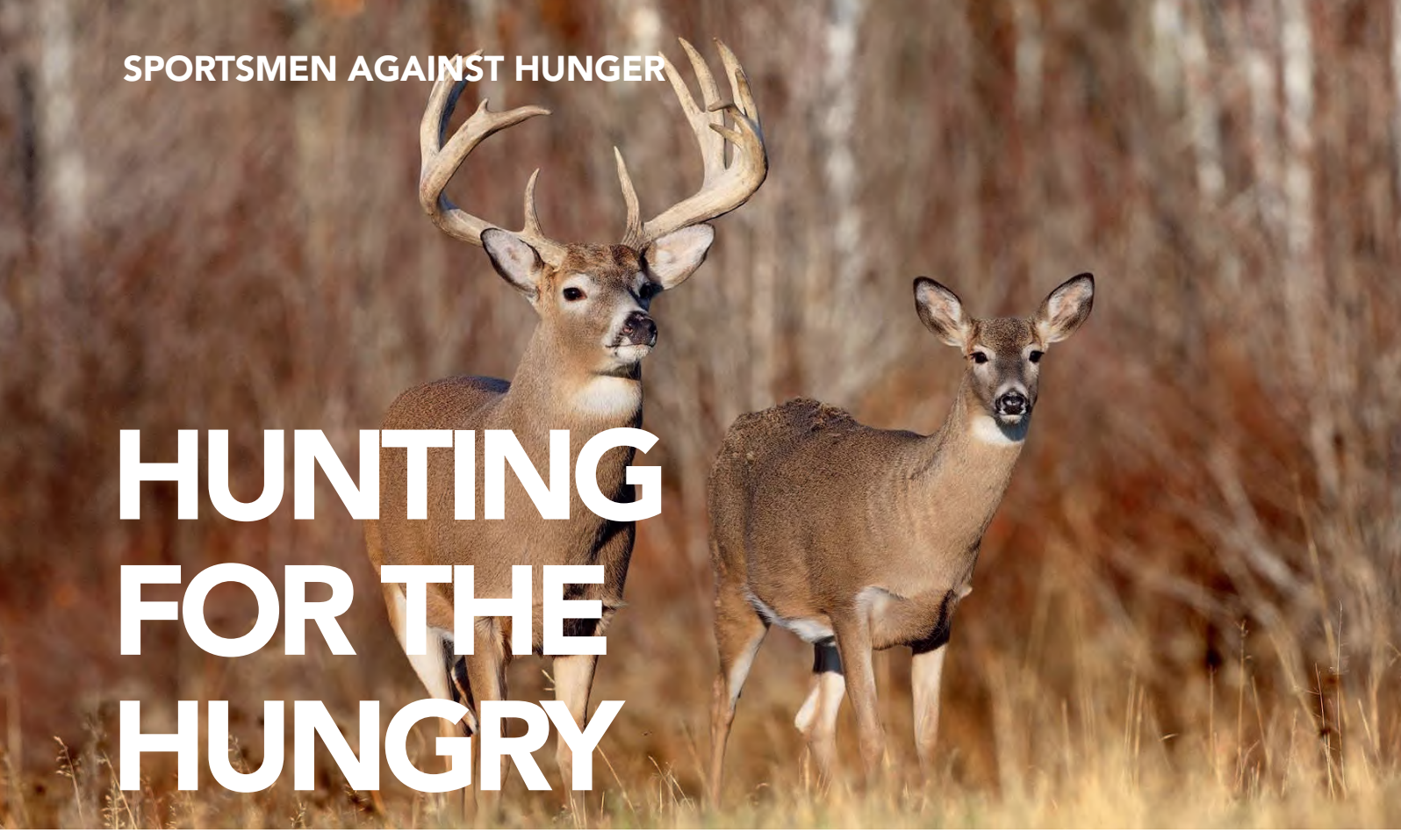
Sportsmen Against Hunger is nearing one million pounds of game meat donated to food banks across the state since 1993.