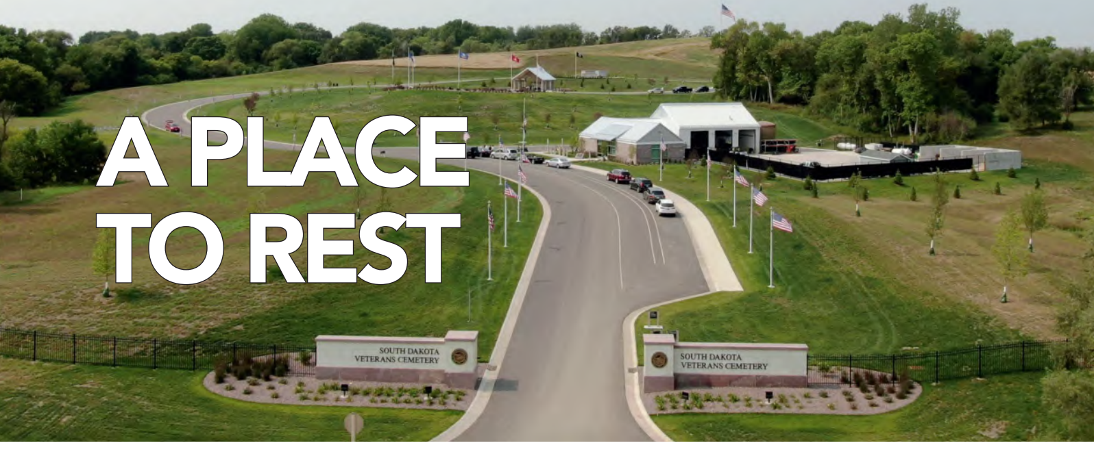
The South Dakota Veterans Cemetery located northeast of Sioux Falls provides a new resting place for U.S. military veterans and their families.