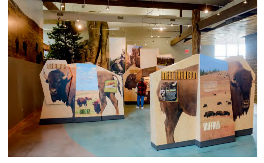
The Custer State Park Bison Center helps educate visitors about the history and importance of the herd of 1,400 buffalo that live in the park.

The biggest day of the year for the Bison Center comes in September during Custer State Park's annual Buffalo Roundup and Arts Festival. This year's event is scheduled for Sept. 28-30. The roundup itself is Sept. 29. Parking lots will open at 6:15 a.m. Mountain Time for people