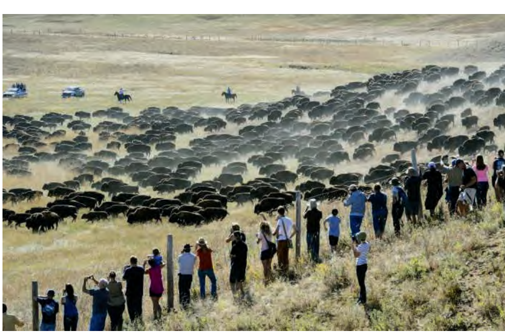
The Custer State Park Buffalo Roundup each September is popular with tourists and helps the state manage the bison that live in the park.

To learn more about the Custer State Park Bison Center, visit gfp. sd.gov/csp-bison-center/.